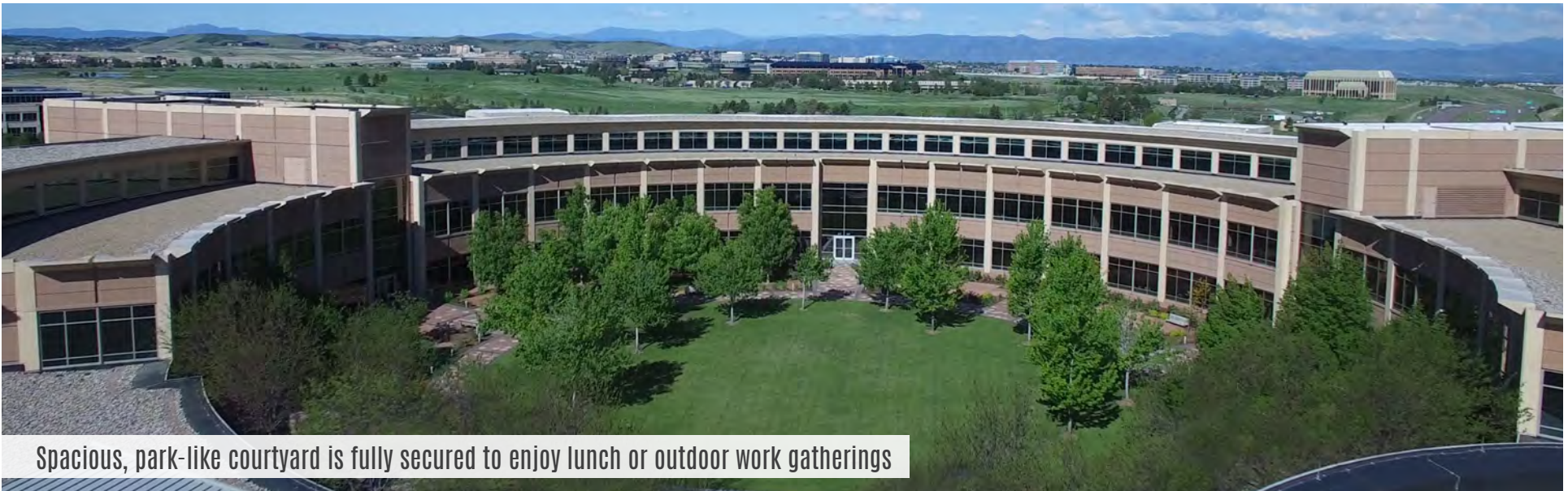
Spacious, park-like courtyard is fully secured to enjoy lunch or outdoor work gatherings